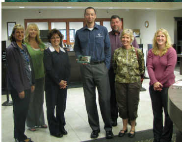
River Cities Staff with the Backers

River Cities Bank visit at 5709 Windy Drive, Ste A, Stevens Point (715) 342-4400 www.rivercitiesbank.com