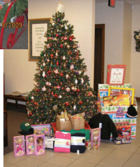
Community First Bank