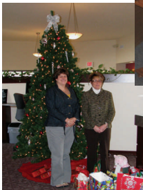
Members' Advantage Credit Union