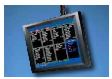
The E-PAD Video Controller provides a powerful way to speed service and increase employee productivity.