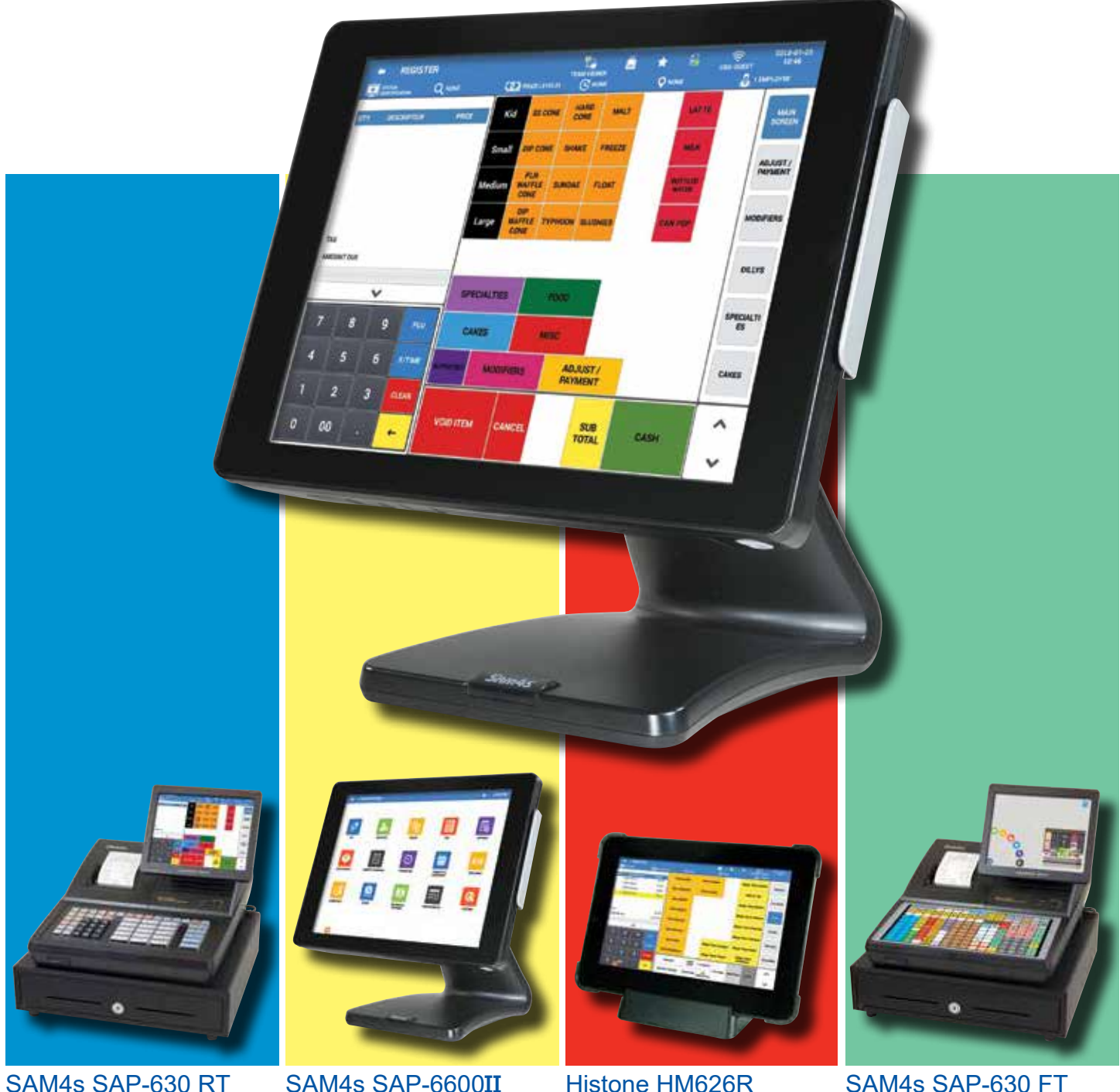
SAM4s SAP-630 RT Raised-Key Keyboard; 9.7" Touch Screen; 3" Receipt Printer

The Sam4Pos application may easily be configured for your food, beverage, or retail business to provide the functions and options you need to meet your point of service requirements.