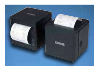
The SAM4s GCube high speed thermal printer, featuring top and front paper exit, can print requisitions for your kitchen or preparation area.