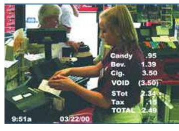
Video surveillance can be targeted and activated for selected workstation and POS terminal activity.