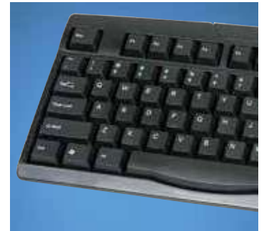
Use an SD card or USB thumb drive for Program Save/Load, report or screen capture, firmware updates and graphics uploading. Connect a keyboard to make programming quick and easy.