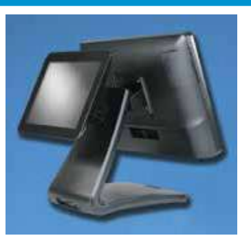
Optional Integrated 9.7" Rear LCD Customer Display