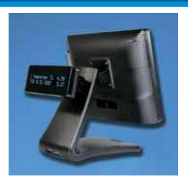
Optional Integrated Rear 2 Lines by 20 Characters VFD Customer Display

A COM2 (Powered) B COM4 C COM1 (Powered) D Line Out (Audio) E LAN F USB (Two V3.0) G COM 3 (Powered) H USB (Two V3.0)