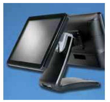
Optional Integrated 15" Rear LCD Customer Display