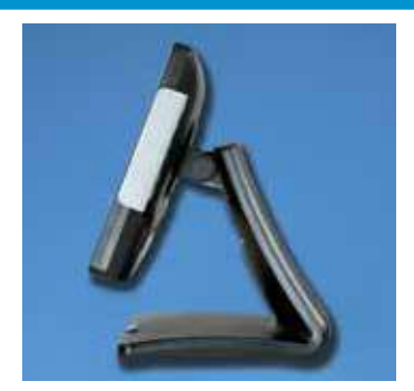
Sleek and Stylish Cabinet Design