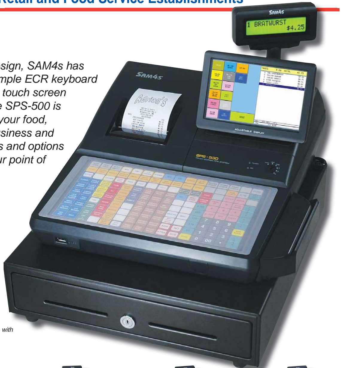
SPS-500 Series Hybrid ECRs Shown with Optional Card Reader

Featuring a hybrid design, SAM4s has combined fast and simple ECR keyboard entry with an intuitive touch screen operator display. The SPS-500 is easily configured for your food, beverage, or retail business and provides the functions and options you need to meet your point of service needs.