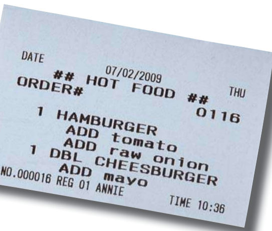
Kitchen requisition printed by the SPS-530 80mm receipt printer shown 75% actual size.