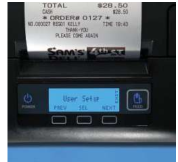
Liquid Crystal Display Guides the Operator Through Setup and Option Selections