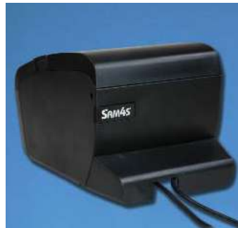
Standard Cable Management Cover