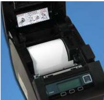
Drop and Print Paper Loading – Optional Paper Width Selector Allows 58mm Wide Paper Rolls