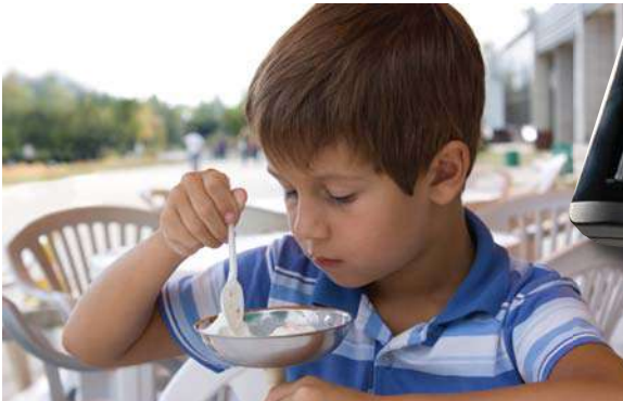
Quick Service Restaurants / Ice Cream Parlors