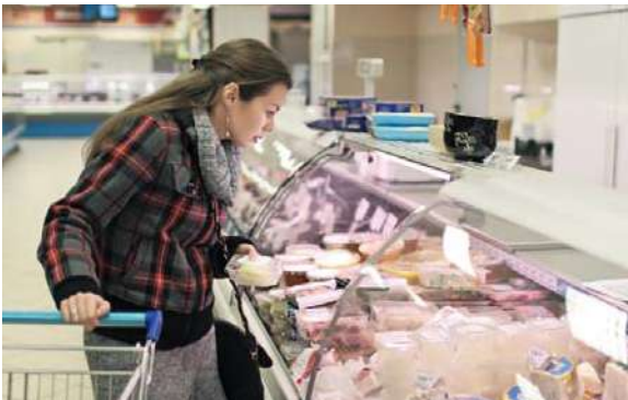
Grocery Stores / Convenience Stores