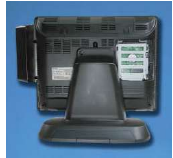
Tool-Free Access to Hard Disk Drive and RAM Optimizes Serviceability