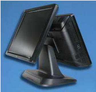
Optional Integrated 15" Rear LCD Customer Display