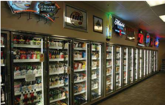
Retail Stores / Liquor Stores