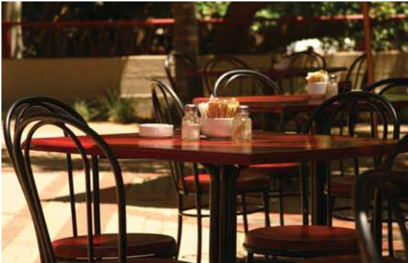
Table Service Restaurants