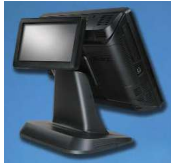
Optional Integrated 7" Rear LCD Customer Display