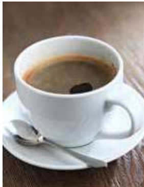
Bars / Ice Cream Parlors / Coffee Shops