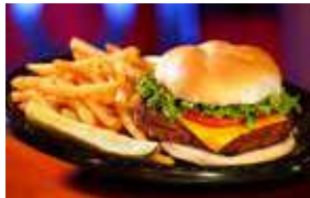
Cafeterias / Table Service / Quick Service