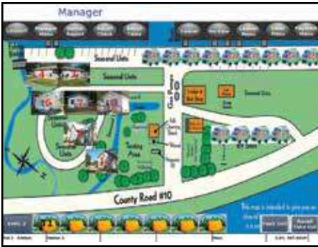
Customized graphical table maps.