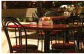
Food Concessions / Fast Casual Restaurants