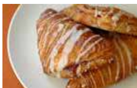
Dusty Environments Like Pizza and Bakeries