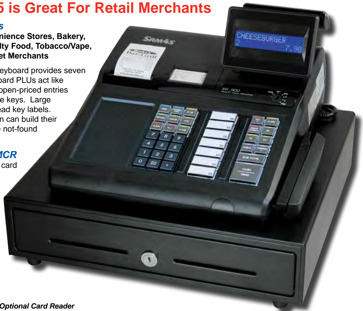
SAM4s ER-915 Shown With Optional Card Reader

Use the optional integrated card reader to swipe payment cards when integrated payment options are implemented.