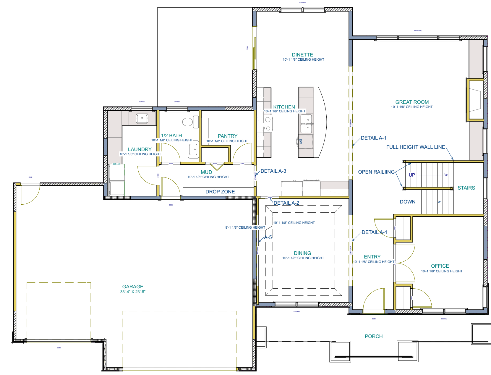
LIVING AREA 1602 SQ FT