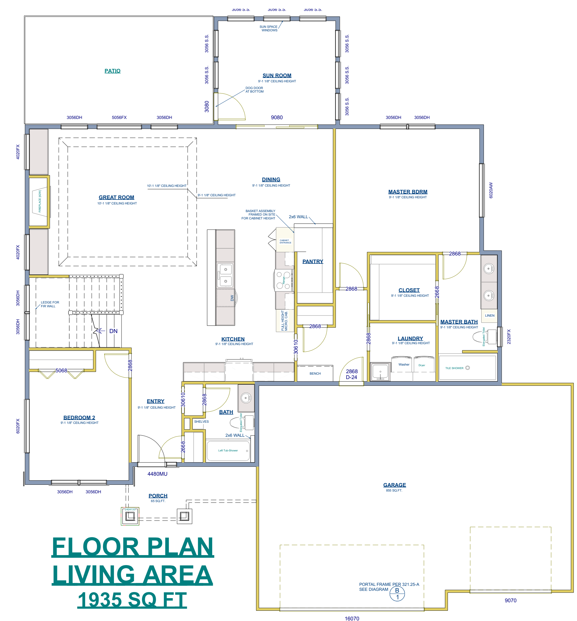
FLOOR PLAN LIVING AREA 1935 SQ.FT